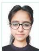
Harman BJS Home Delivery