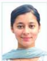
Archana BJS Home Delivery