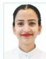
Ishika Holiday INN