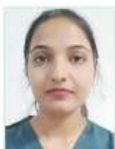
Amritpal Kaur Johal Multispecialty Hospital